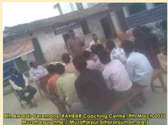
8th Awards Ceremony, RAHBAR Coaching Centre, 9th March 2011 Muzaffarpur [http://Muzaffarpur.biharanjuman.org/]

Details of awardees in the three categories and more photographs can be seen at the centre's website @ http://muzaffarpur.biharanjuman.org/