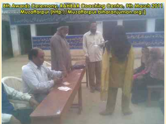
8th Awards Ceremony, RAHBAR Coaching Centre, 9th March 2011 Muzaffarpur [http://Muzaffarpur.biharanjuman.org/]