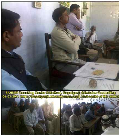
RAHBAR Coaching Centre @ Hathwa, Gopalganj: Admission Counselling 06-03-2011 [http://gopalganj2.biharanjuman.org/]. 2nd centre of the district