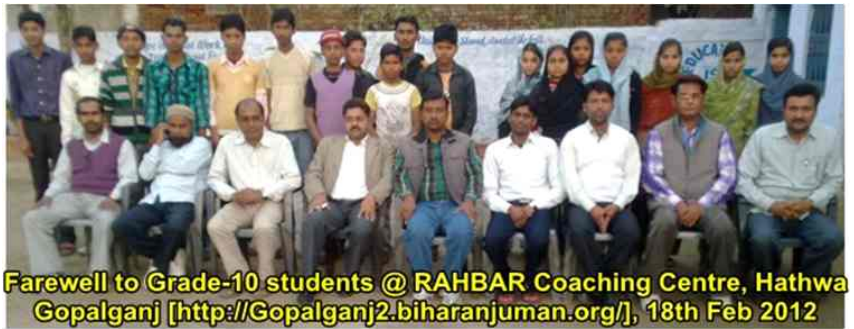
Farewell to Grade-10 students @ RAHBAR Coaching Centre, Hathwa Gopalganj [ http://Gopalganj2.biharanjuman.org/ ], 18th Feb 2012

Rahbar prizes of different categories to the students of Grade VIII and