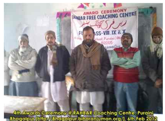
4th Awards Ceremony @ RAHBAR Coaching Centre, Puraini Bhagalpur ( http://Bhagalpur.biharanjuman.org/ ). 6th Feb 2012

The ceremony concluded on the chorused recitation of dua "lab pe aati hai dua ban ke"