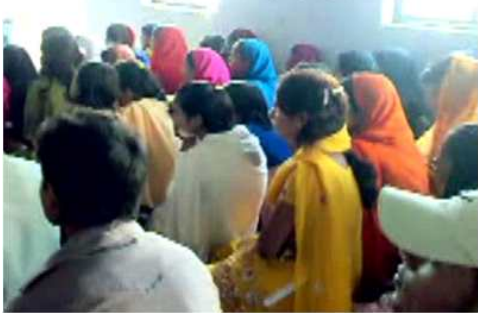
3rd Awards Ceremony [http://gopalganj.biharanjuman.org/] RAHBAR Coaching Centre, Gopalganj, 14th Nov 2010