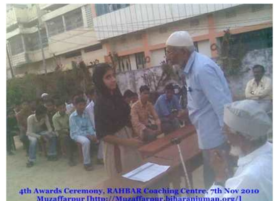
4th Awards Ceremony, RAHBAR Coaching Centre, 7th Nov 2010 Muzaffarpur [ http://Muzaffarpur.biharanjuman.org/ ]

Details of awardees in the three categories and more photographs can be seen at the centre's website @ http://muzaffarpur.biharanjuman.org/