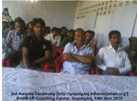
3rd Awards Ceremony [http://gopalganj.biharanjuman.org/] RAHBAR Coaching Centre, Gopalganj, 14th Nov 2010