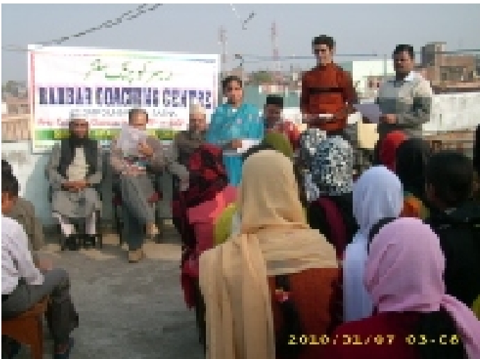
Award ceremony in RAHBAR Coaching Centre, Patna

We can make it large with all valid reasons as the UAE Government as well as the "EMIRATIS" are supporting to their level best in making & restoring our hopes, lives, families as we were before. Feel pride & fortunate enough to be a part of this great nation. May this kingdom keeps on glorifying & becomes a live case study to the whole world for being so well structured, prepared, groomed & blessed where one will always yearn to have its blessings. Suggestions are welcome on the land for the rising hopes, not the razed ones.