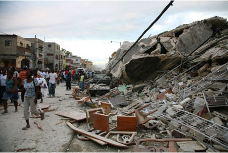
Earthquake in Heiti, more than 100000 people killed

فکری شبہات پیدا ہو جائیں، جن کے سبب عقائد ہی مختل ہو جائیں اور عقائد کے مختل ہونے سے عمل صالح کا خلل پذیر ہونا خود ظاہر ہے اور دوسرے شہوات یعنی خواہشات نفسانی جو انسان کو بعض اوقات نیک عمل سے روک دیتی ہیں، اور بعض اوقات برے اعمال میں مبتلا کر دیتی ہیں اگرچہ نظری اور اعتقادی طور پر نیکی پر عمل اور برائی سے بچنے کو ضروری سمجھتا ہو مگر نفسانی خواہشات اس کے خلاف ہوں اور وہ ان خواہشات سے مغلوب ہو کر سیدھا راستہ چھوڑ بیٹھے تو آیت مذکورہ میں وصیتِ حق سے مراد یہ ہے کہ نفسانی خواہشات کو چھوڑ کر اچھے اعمال اختیار کرنے کی ہدایت کرے اس کا خلاصہ یہ ہے کہ وصیتِ بالحق سے مراد دوسرے مسلمانوں کی علمی اصلاح ہے اور وصیتِ بالصبر سے مراد عملی اصلاح“