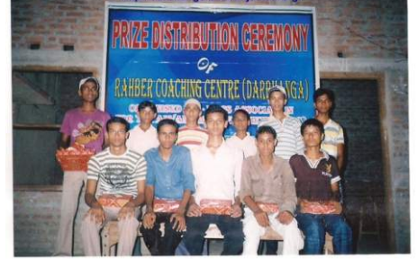
RAHBAR Coaching Centre, Darbhanga: Awarding 10th pass-outs, 13th June 2010 http://darbhanga.biharanjuman.org/

school for holistic education of GIRLS only), operational since 1st December 2009, offers FREE education to 125 poor girls, with 3 teachers: Building construction work started in 1st week of May, and construction work upto plinth level got completed, on 10th June 2010, for its 3 storeyed hostel building, designed by a professional gulf-based engineer. The hostel building has been so designed that it can serve the dual purpose of