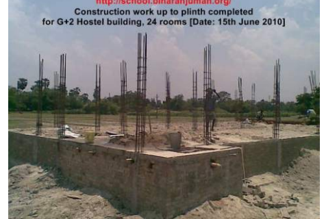
RAHBAR-e-Banaat (School-cum-madrasa): holistic education to girls)

class-rooms as well as hostel, until we can construct separate class-room buildings, for which design is ready [available on the website]. This project is in urgent need of funds for construction as well as for operation (new teachers, and their salary being the main cost, currently). Be a part of the first school project of Bihar Anjuman: view details @ http://school.biharanjuman.org/ ... This is the largest project of Bihar Anjuman, so far, and the most ambitious as well.