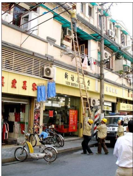
There is no excuse for performers

Don't ignore, think about it. It can change life of thousand of people.