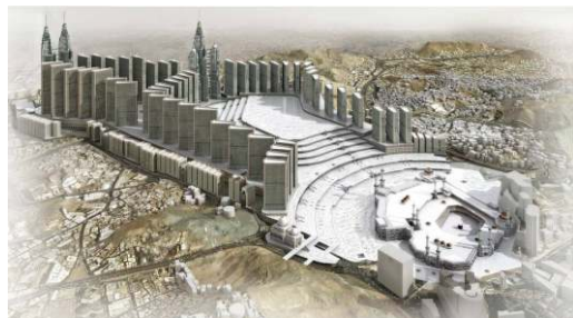
The plan for extension of Haram (Kaaba)