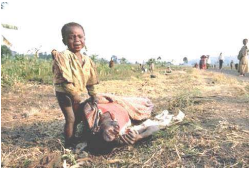
Help to poor Allah will help to you

ماں کی ممتا کا کیا صلہ دیتے چار پیسے نہ ہم نکال سکے چار بیٹوں کو جس نے پالا تھا چار بیٹے نہ اُس کو پال سکے