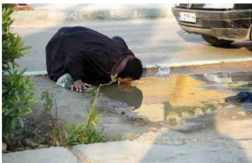
Water is Precious ....Do not waste it