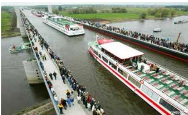
Water Bridge in Germany