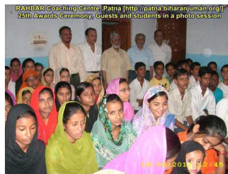
RAHBAR Coaching Centre, Patna [http://patna.biharanjuman.org/] 25th Awards Ceremony, Guests and students in a photo session