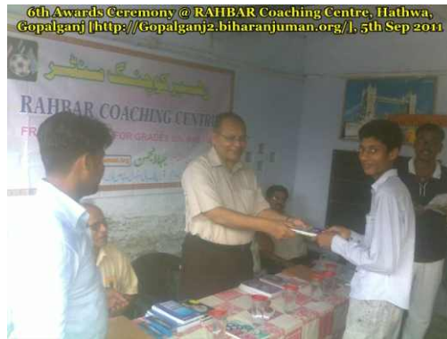
6th Awards Ceremony @ RAHBAR Coaching Centre, Hathwa, Gopalganj