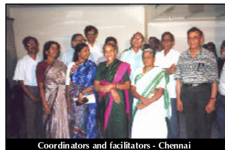
Coordinators and facilitators - Chennai

The Foundation accomplishes its mission through a network of volunteer coordinators and facilitators. Coordinators are US citizens and permanent residents. Facilitators are persons resident in India. Currently, 200 coordinators and 800 facilitators are enrolled with the Foundation.