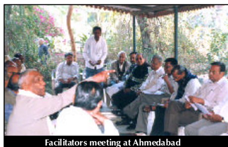
Facilitators meeting at Ahmedabad