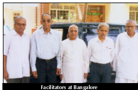
Facilitators at Bangalore